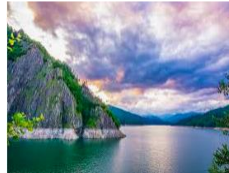
Creative Commons CC0 license.

This is a picture of glacial water, which is frozen freshwater.