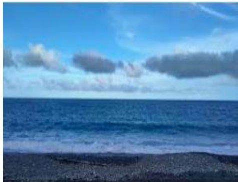
Creative Commons CC0 license

Water is everywhere on Earth. There are many types of water reservoirs on Earth. Some water is on Earth’s surface. Some water is underground. A large portion of all water on Earth’s surface is saltwater. A very small portion is freshwater. Below are some pictures of some different types of reservoirs.