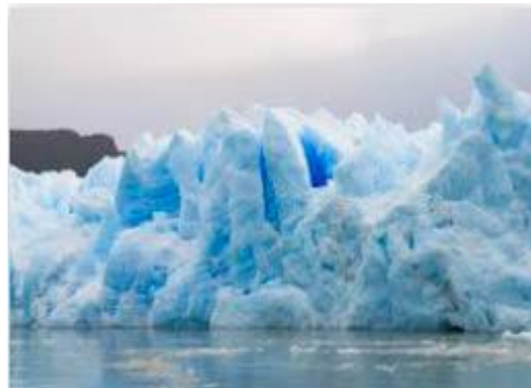
Creative Commons CC0 license.

This is a picture of ocean water, which is liquid saltwater.